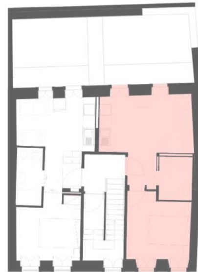
1/F First Floor